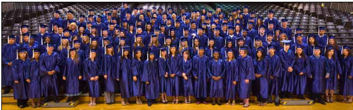
The Hope Online Class of 2010